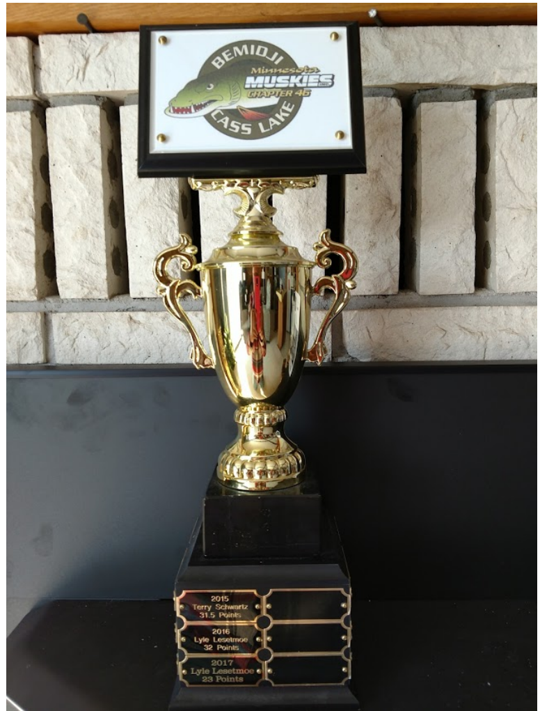
Musky Hunter of The Year Trophy (Outings points)